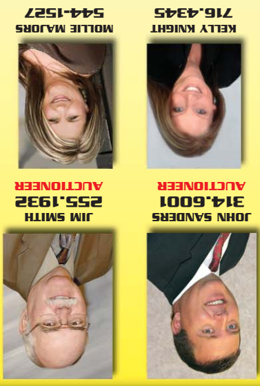
YOUR PROFESSIONAL AUCTION TEAM

For More Information & Photos Visit www.johnsandersauction.com