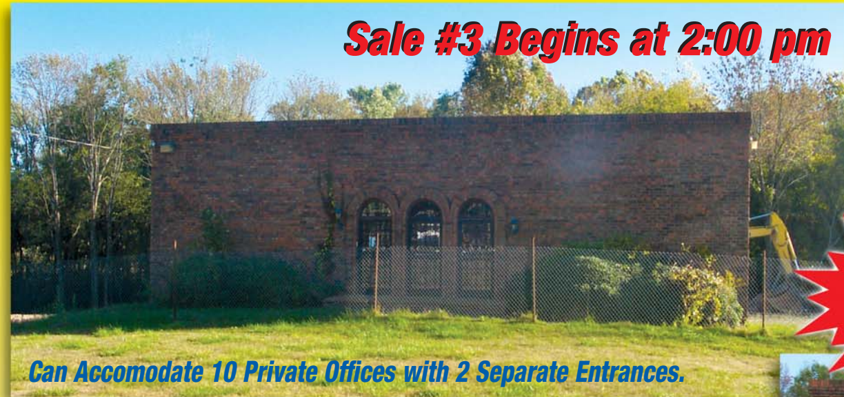
Can Accomodate 10 Private Offices with 2 Separate Entrances.

TRACT 1 - 1.9 ± Acres with a 2,530 sq/ft Office Building.