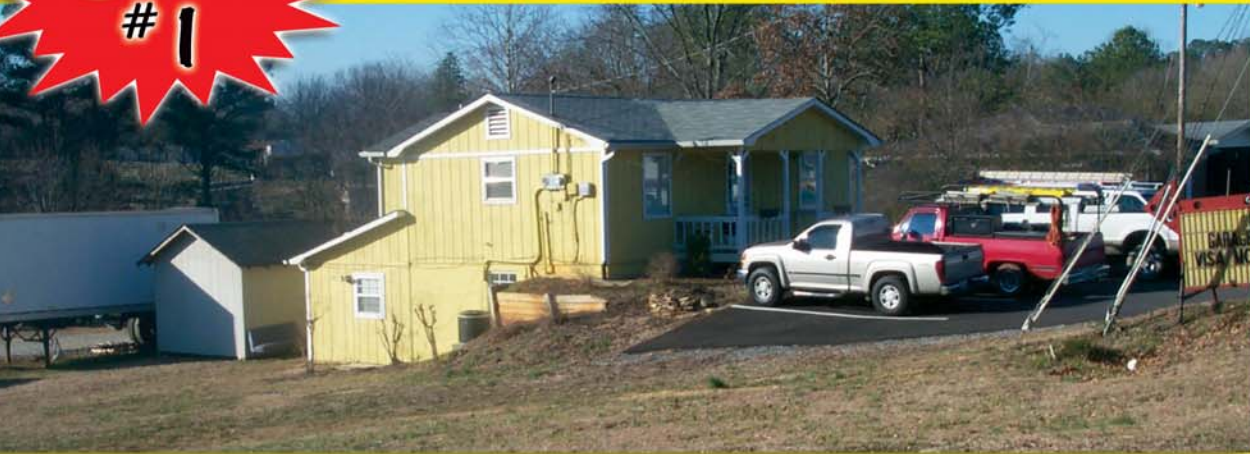
2520 20th Street – Cleveland, Tennessee