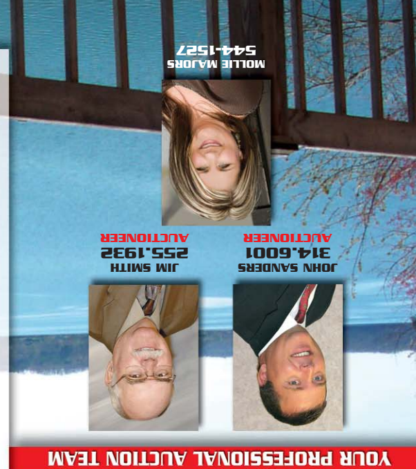
YOUR PROFESSIONAL AUCTION TEAM