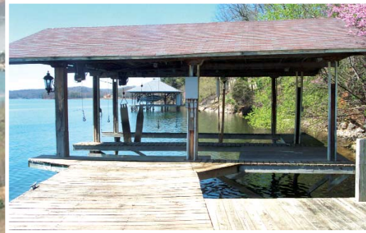
Nice Covered Double Boat Slip with Lifts, large enough to accommodate pontoon or mid-size cruiser.