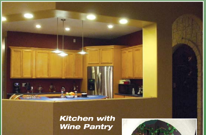
Kitchen with Wine Pantry