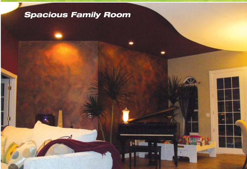
Spacious Family Room