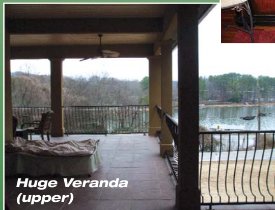
Huge Veranda (upper)