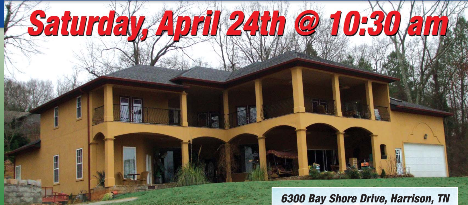
6300 Bay Shore Drive, Harrison, TN