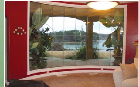
Huge Picture Window overlooking Lake